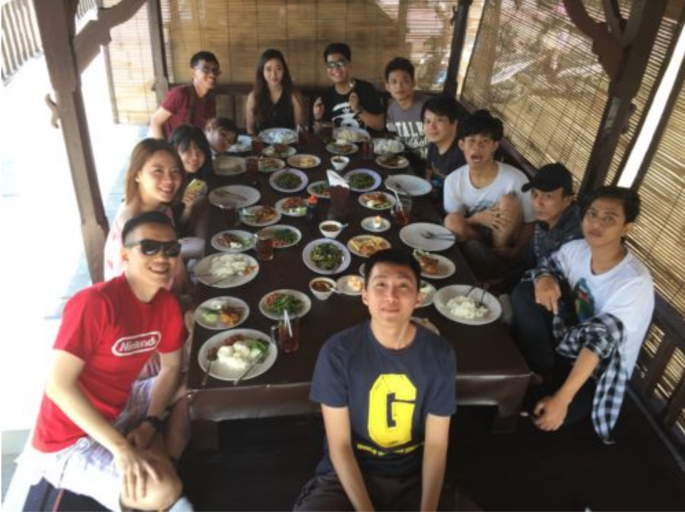
Beautiful place, friends, food.