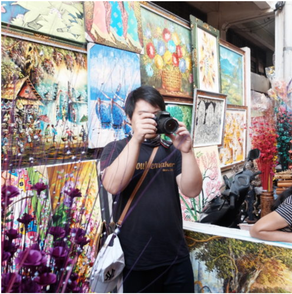
Shopping at Sukawati Art

Market, is more than shopping, it's also enjoying arts.