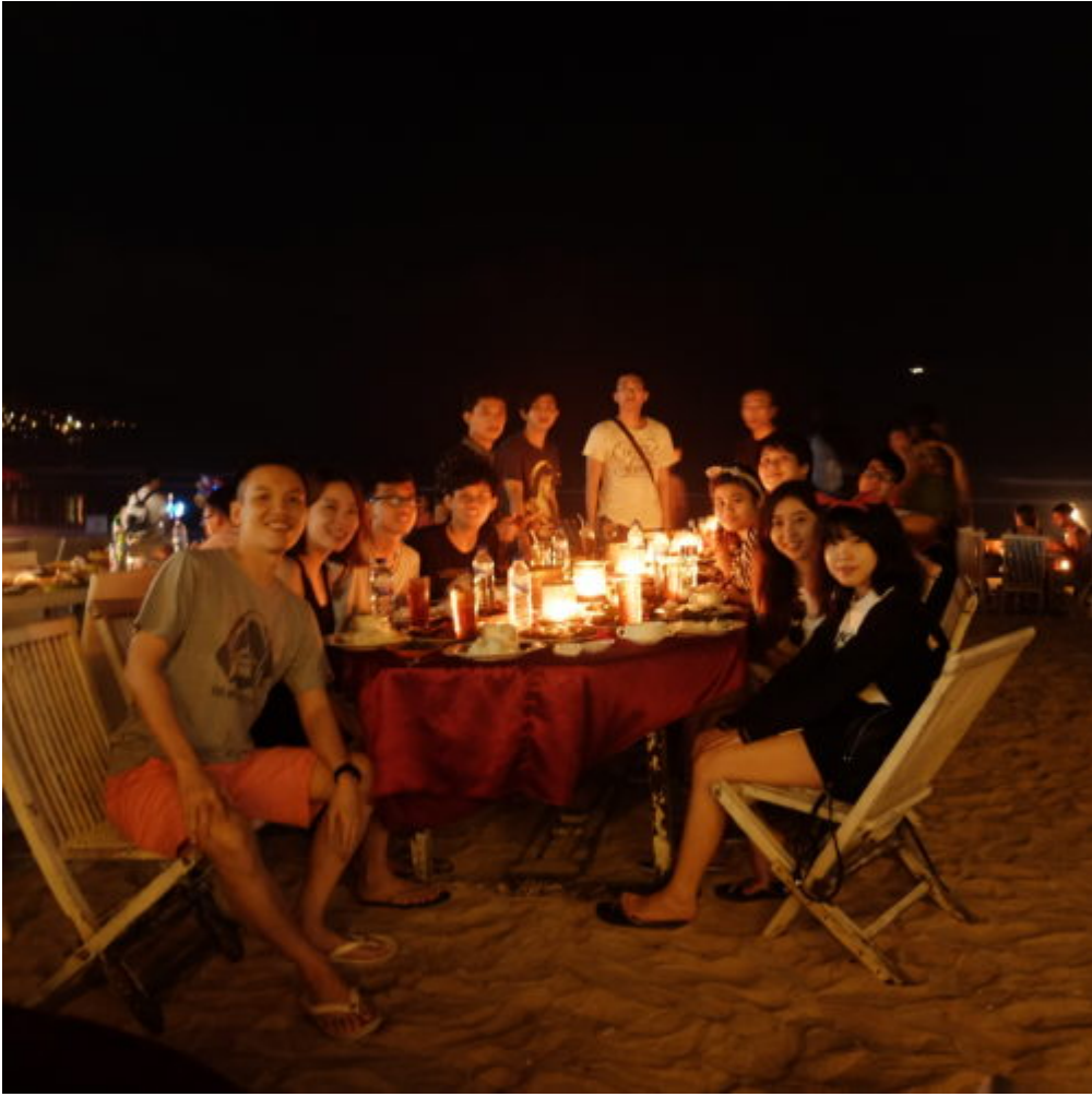
Day two, shopping and breath Bali's scenery