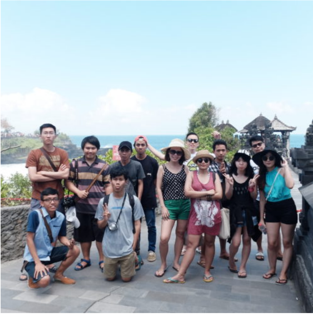
Seminyak beach here we come! Yes we have planned to do team games at beach, it was fun, and make us bond stronger as a team.