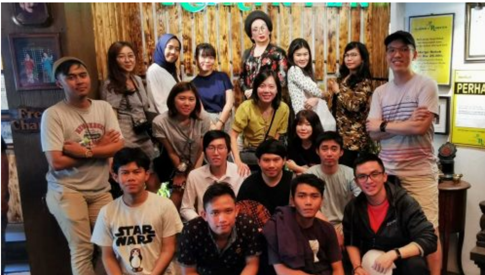
It Was A Wrap, We Left our Hearts at Yogyakarta

Our last lunch at House of Raminten to close our last day in Yogyakarta. After that, it's time to return home with lot of sweet memories. See you in another time!