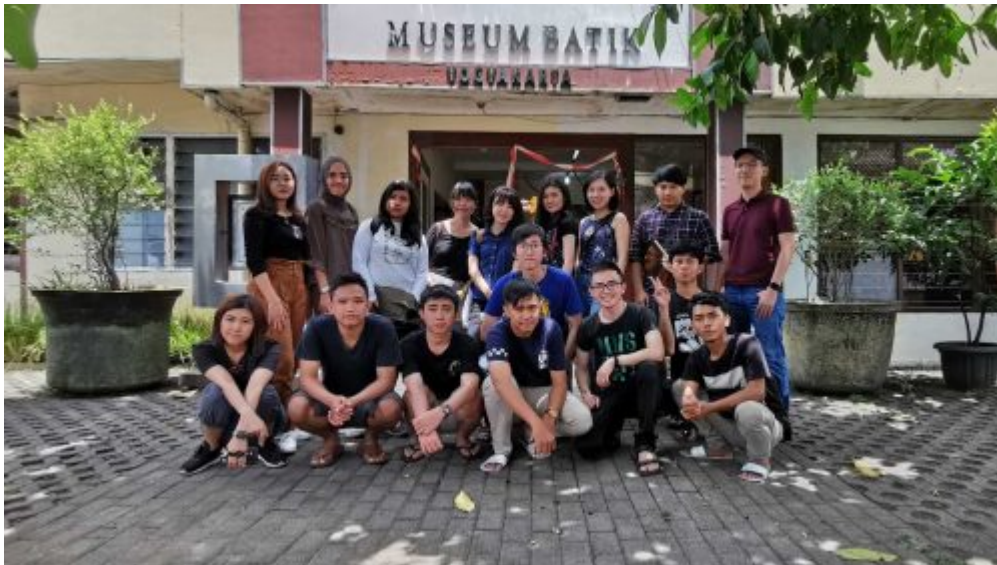
Challenge Accepted at Museum Batik Yogyakarta

Do not forget to enjoy the beautiful Prambanan Temple when in Yogyakarta. Oh, also take some photos in the middle of golden hour is a must!