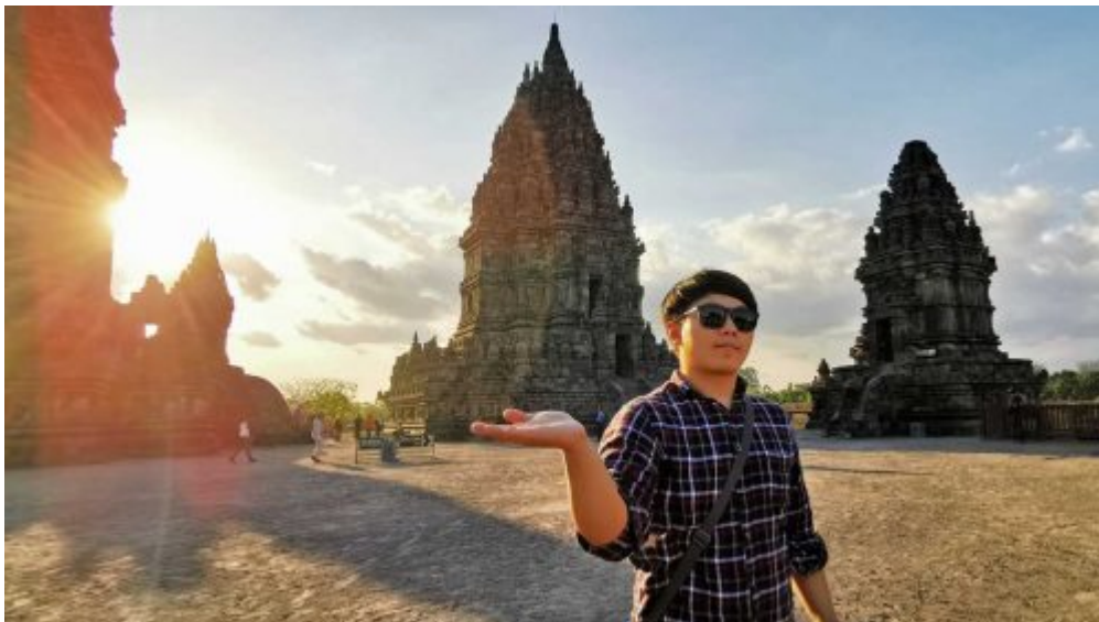
Golden Hour featured Prambanan Temple

Do not forget to enjoy the beautiful Prambanan Temple when in Yogyakarta. Oh, also take some photos in the middle of golden hour is a must!