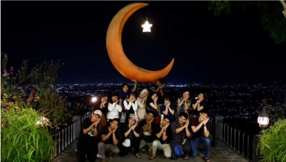
A Night to Remember at The Manglung, Bukit Bintang

Our last lunch at House of Raminten to close our last day in Yogyakarta. After that, it's time to return home with lot of sweet memories. See you in another time!