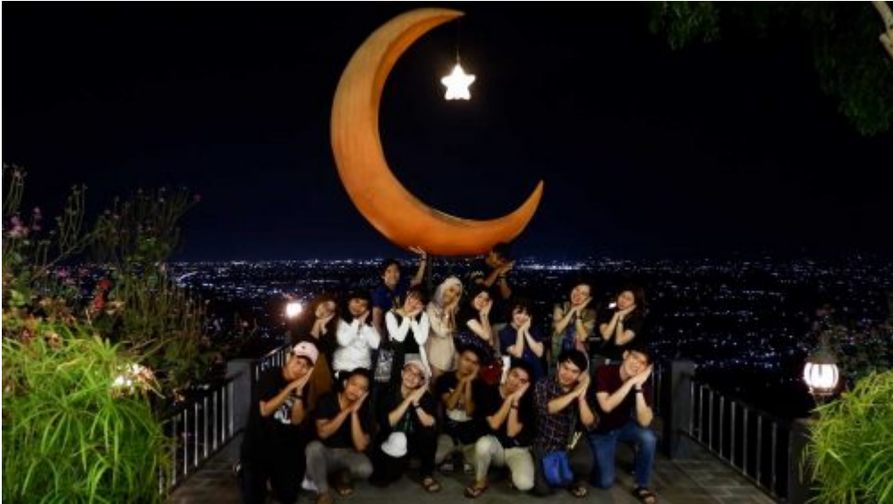
A Night to Remember at The Manglung, Bukit Bintang

Our last lunch at House of Raminten to close our last day in Yogyakarta. After that, it's time to return home with lot of sweet memories. See you in another time!