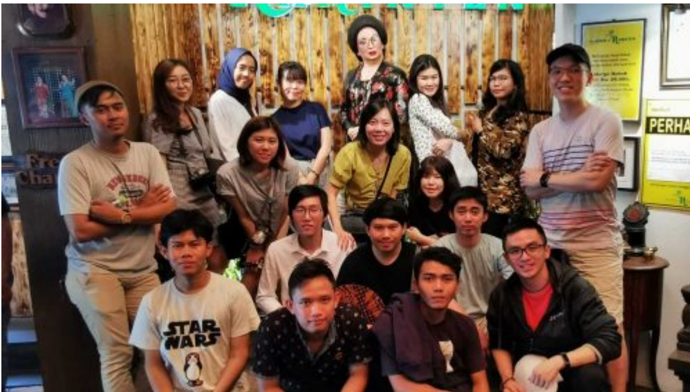
It Was A Wrap, We Left our Hearts at Yogyakarta

Our last lunch at House of Raminten to close our last day in Yogyakarta. After that, it's time to return home with lot of sweet memories. See you in another time!